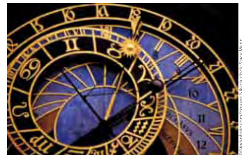
The Charles Bridge, left, in Prague is lined with statues of the saints. An aerial view, top, of Prague's Old Town. The astronomical clock, above, in Prague.

The highlight is St Vitus Cathedral, a rearing Gothic edifice that is so tightly surrounded by other buildings it's a little difficult to appreciate. The cathedral was begun in 1344 over the site of an earlier church and not completed until 1927, which perhaps explains its rather chaotic architecture and lopsided appearance. The interior is now a treasure-trove of Czech art and stained glass and contains the tombs of former kings, including a glorious chapel to King Wenceslas, a Bohemian monarch immortalized in the well-known Christmas carol.